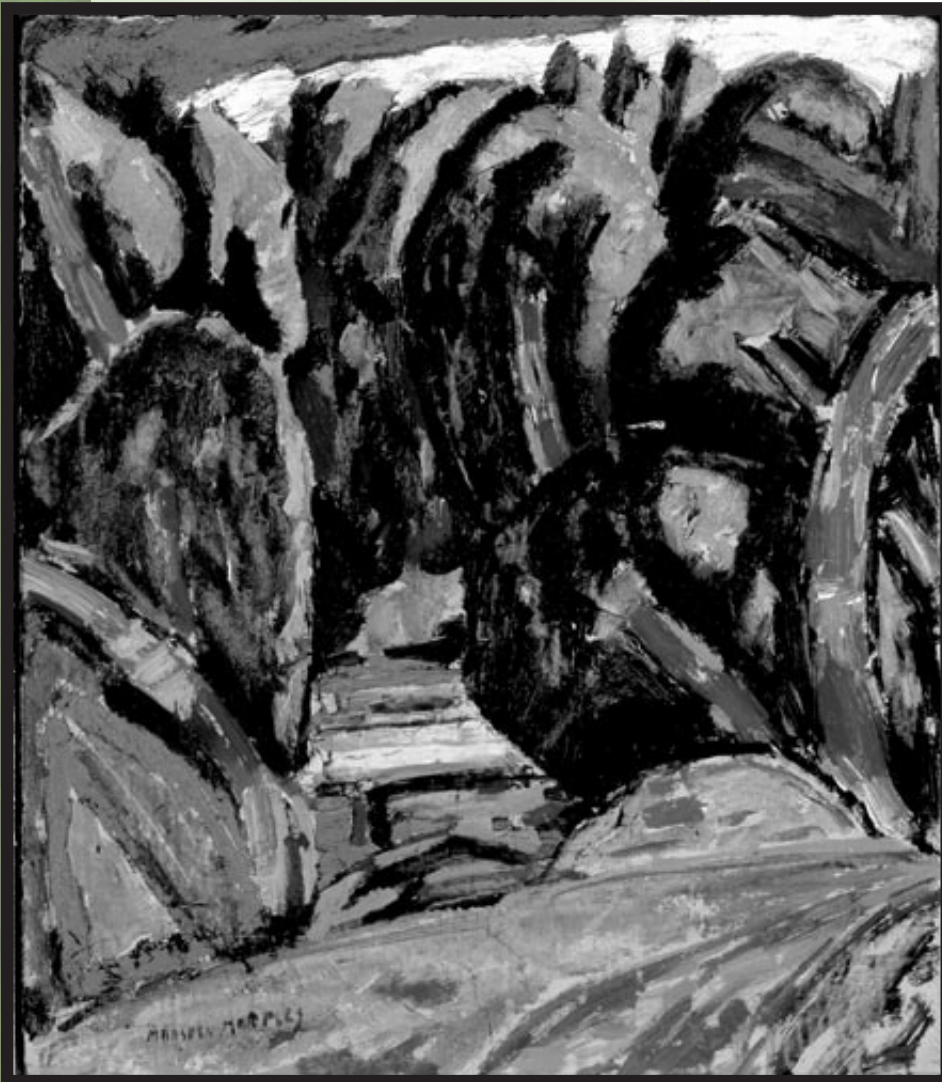
"Red Tree," Marsden Hartley. Smithsonian American Art Museum, Washington, DC