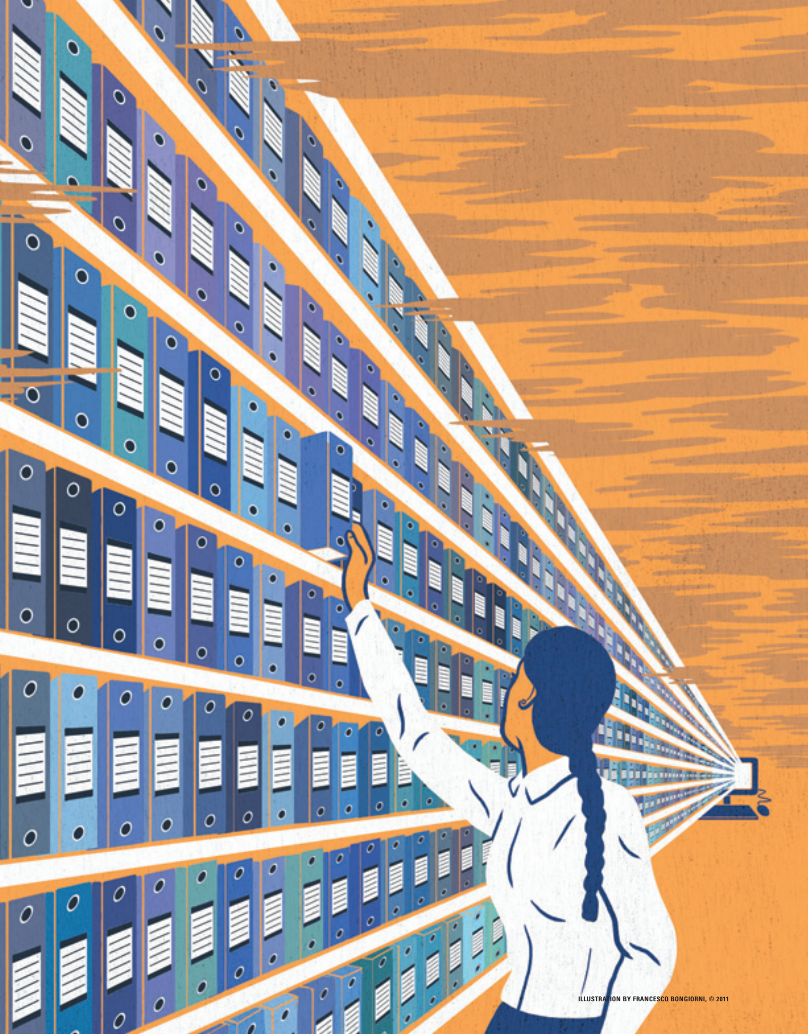
ILLUSTRATION BY FRANCESCO BONGIORNI, © 2011