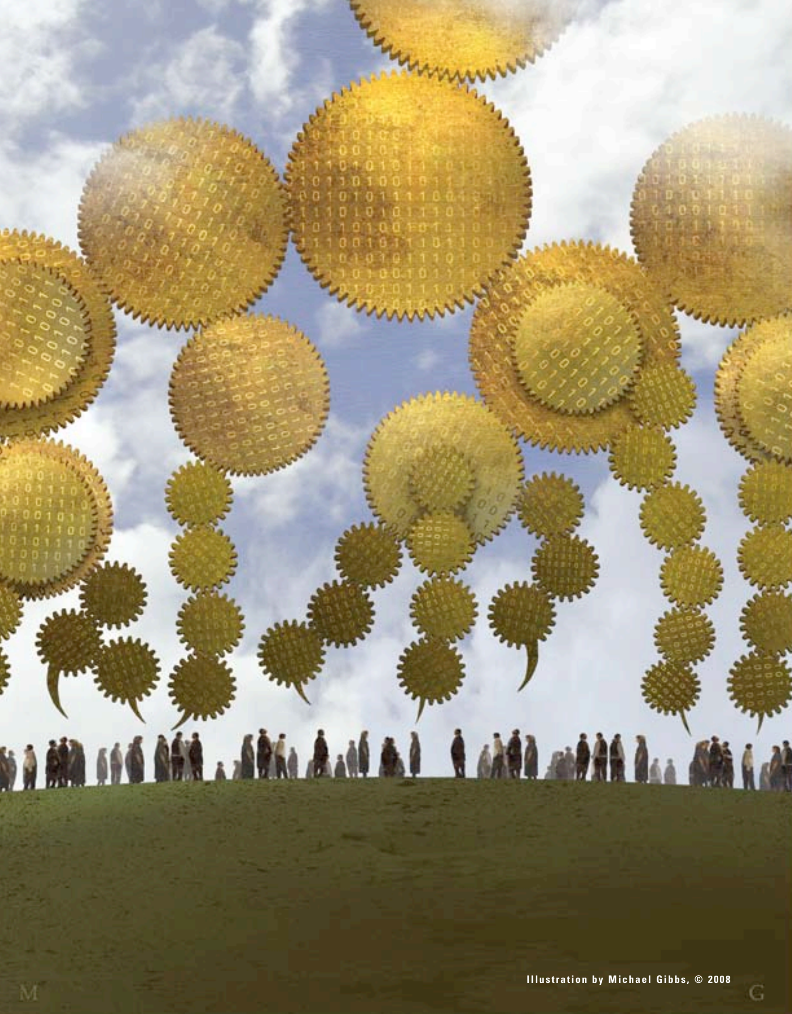
Illustration by Michael Gibbs, © 2008

Things to Do While Waiting for the Future to Happen: