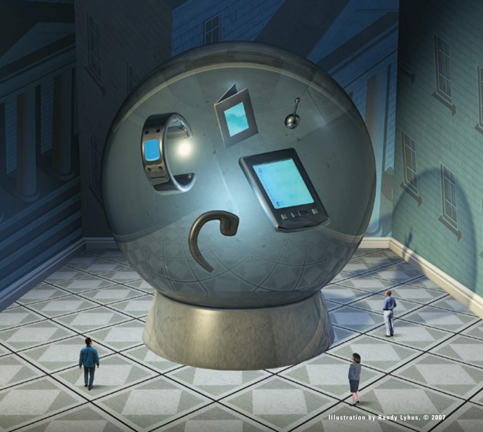
Illustration by Randy Lyhus, © 2007