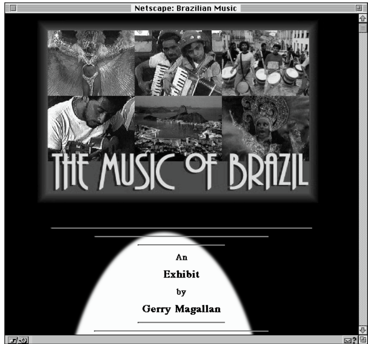
Figure 4: An example of a student arts exhibit on Brazilian music

mon time and place when everyone can meet to work on the project. Instead, telecommunication and networking technologies expand place and time by permitting students to collaborate in the same place, but at different times.