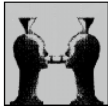
Guide on the Side

"Networking and Internet connectivity is critical to our teaching strategies."