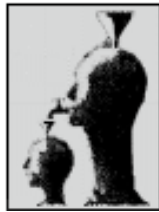
Sage on the Stage